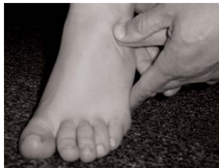
Figure 4: Mobilization with movement (MWM) of the cuboid. With patient seated, operators' thumbs deliver sustained pressure to the proximal medial cuboid to pronate the cuboid in frontal plane, as the patient plantarflexes at the ankle and mid-foot during a seated heel raise.