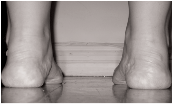
Figure 8: Posterior view after the subject's 2nd consultation. Note full weight bearing on the 1st metatarsal phalangeal joints of both feet after bilateral manipulation.