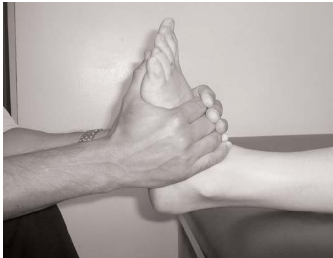
Figure 1: Talocrural joint separation high velocity low amplitude thrust (HVLAT). With patient in supine, operator gently positions the ankle in slight dorsiflexion and grasps dorsal foot with both hands: thumbs on plantar aspect and 5th fingers over anterior talus. The operator applies an axial distraction force with HVLAT. Tibia can be stabilized to protect proximal joints.

An idiopathic cavus foot may exist due to hypomobility of any combination of the many joints in the foot and ankle. Joint manipulation to the hypomobile foot or ankle joints, followed by soft tissue surgery and serial casting as described by Ponseti and Smoley, 18 has become common in pediatric cases of idiopathic clubfoot. Compared to manipulation and surgical arthrodesis, the