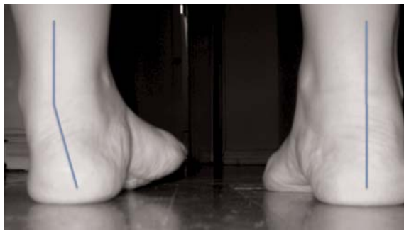
Figure 7: Posterior view after the subject's 1st consultation. Note the marked rearfoot varus alignment of the uncorrected left foot compared to the corrected right foot rearfoot alignment.

The manipulation sequence was repeated on her left foot at the second consultation, three weeks later, when her feet did not exhibit signs of cavus deformity (Figure 8), except for lateral claw toes due to residual soft tissue