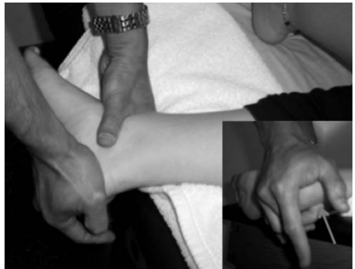
Figure 2: Strain Counterstrain for the lateral calcaneus tender point (LCA). With patient in side lying and LCA monitored with the operator's right 3rd digit (inset), right hand directs force to the medial posterior calcaneus for 90 seconds while left hand supports anterior talus.

The subject is a 27-year-old woman who presented with bilateral idiopathic cavus feet. Both feet appeared to have uncompensated rear- and forefoot varus deformities such that her first rays were atypically not plantarflexed and she bore no weight on the medial side of her foot in standing and walking. The subject's mother, who reportedly has similar but less severe cavus feet, reported that the subject's feet had always appeared the same since beginning to walk at eight months old. The subject's parents sought medical intervention at two years of age to address her bow-legged and hyper-lordotic posture. The physician assured them, however, that any deformity would correct as she developed without treatment or orthoses. Although the subject always walked on the lateral border of both feet, she had no other medical issues other than an ankle sprain from a car accident when nine years old. She never limited her activities and as an adult has exercised four to