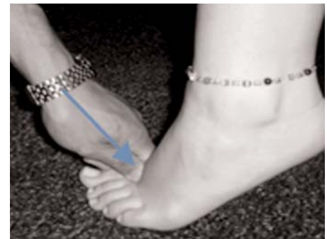
Figure 5: Mobilization with movement (MWM) of the 1st metatarsal phalangeal joint. With patient seated, operator's thumb and 2nd proximal interphalangeal joint deliver sustained pressure on the distal aspect of the metatarsal head at an oblique angle to facilitate plantar glide of the metatarsal head and metatarsal phalangeal dorsiflexion during seated heel raise.