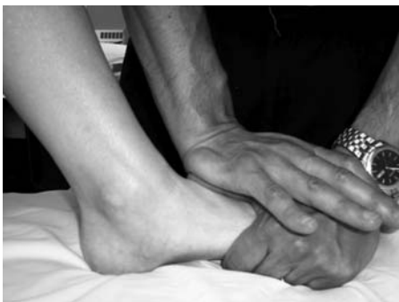
Figure 3: High velocity low amplitude thrust (HVLAT) applied to the dorsal navicular. With patient in hook lying, operator grasps medial metatarsals and pulls into dorsiflexion while left thumb rests on the superolateral border of the navicular. The operator applies a dorsal-plantar HVLAT with the hypothenar eminence of the right hand through the thumb to the navicular.

five times per week. Over the past five years, however, the subject reported insidious low back pain and bilateral hip pain ranging in intensity from three to seven on a scale with ten being the worst pain. She also reported bilateral clicking heel pain and overall discomfort in both feet. Pain on her left side had progressed in the past year leading her to consult a physical therapist.